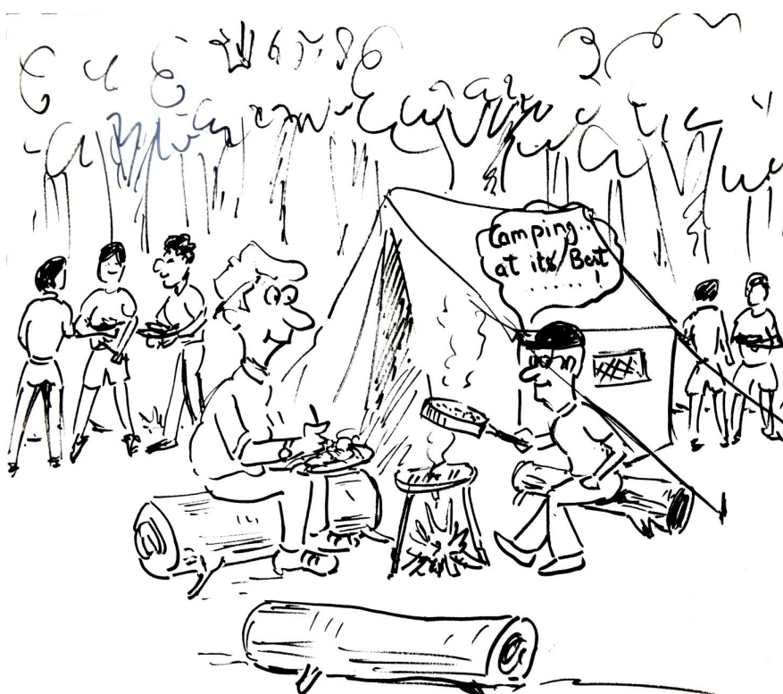
Sketch: Ansh Taneja, IX O