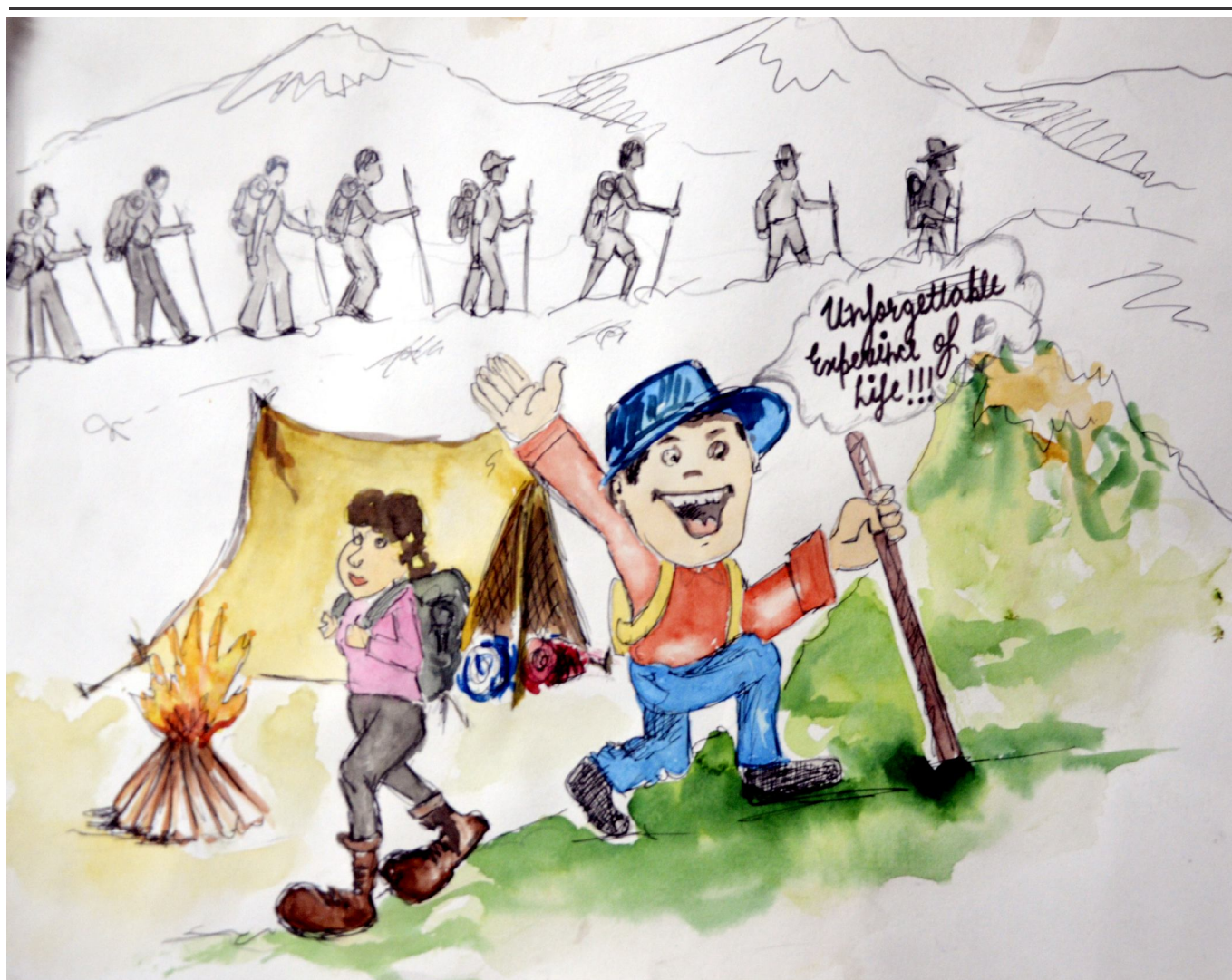
Sketch: Inayat Ranwa, XII Arts